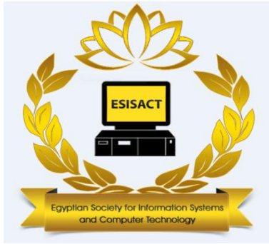
Egyptian Society for Information Systems